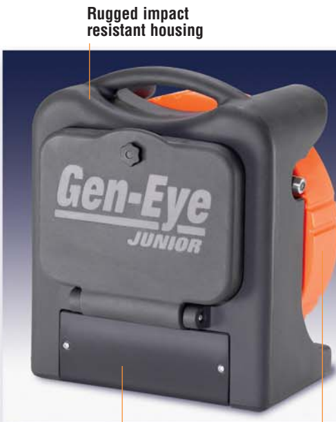
Rugged impact resistant housing

AC/DC power supply with optional 12-volt rechargeable battery that lasts up to 3 hours